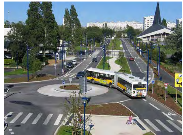
Figure 2 A multi-modal roundabout