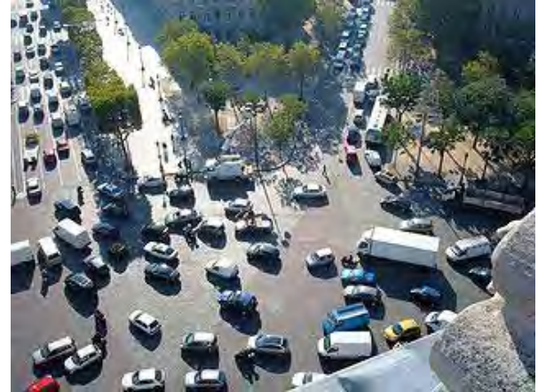
Figure 1 The traffic circle at the Arc de Triomphe, in Paris

The roads are at right angles to the circle. Priority is given to cars entering the circle. Pedestrians have access to the centre.