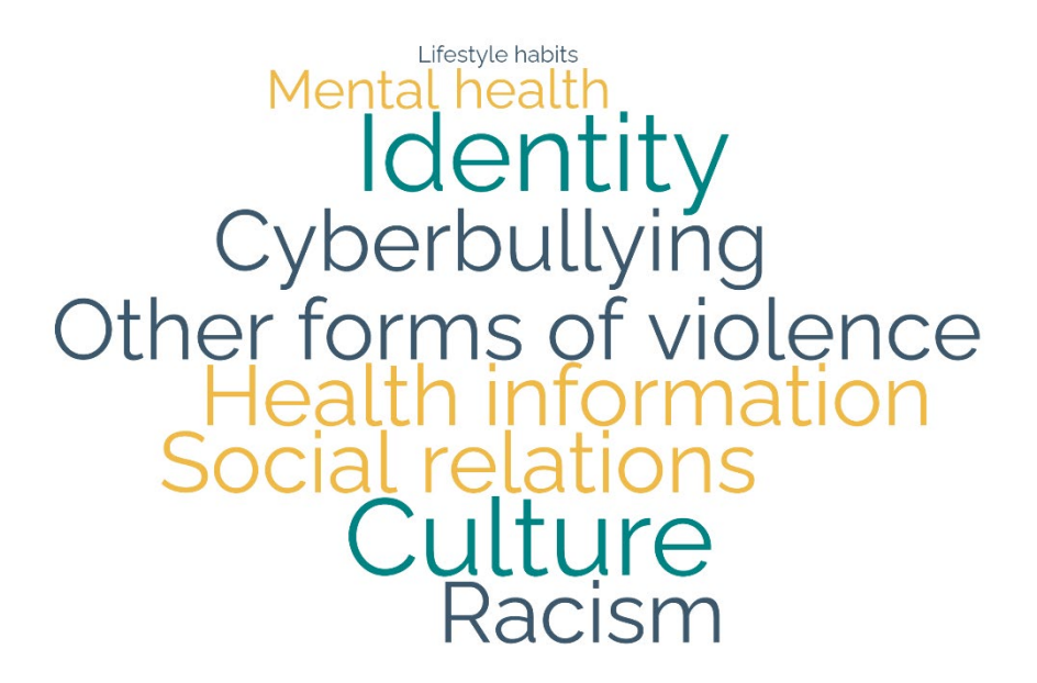
Figure 1 Word cloud of health themes that emerge from the corpus

While offering a simple way of presenting results, the six health themes presented produce an artificial separation between the different spheres of daily life. Themes are just one way of presenting and articulating information.