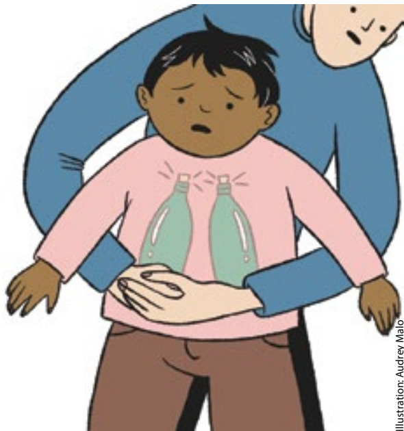
Illustration: Audrey Malo