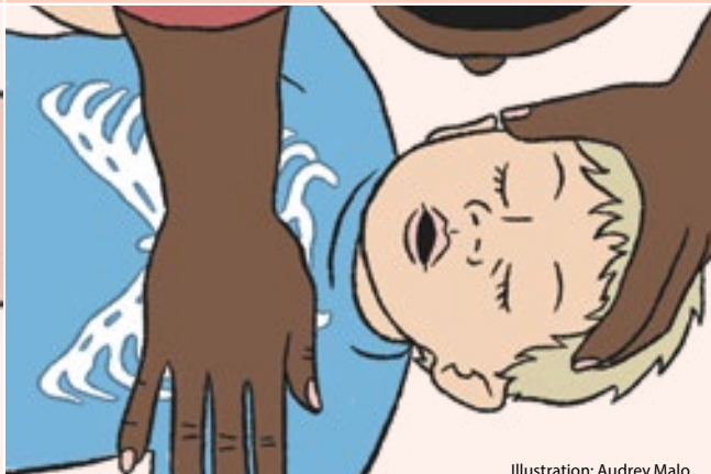
Illustration: Audrey Malo

Press down on the middle of the chest with the palm of your hand, between the nipples.