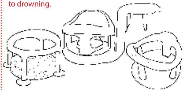
Illustration: Santé Canada

Health Canada advises against using bath seats to ensure the safety of babies in a bath tub. They give adults a false sense of security, which can lead to drowning.