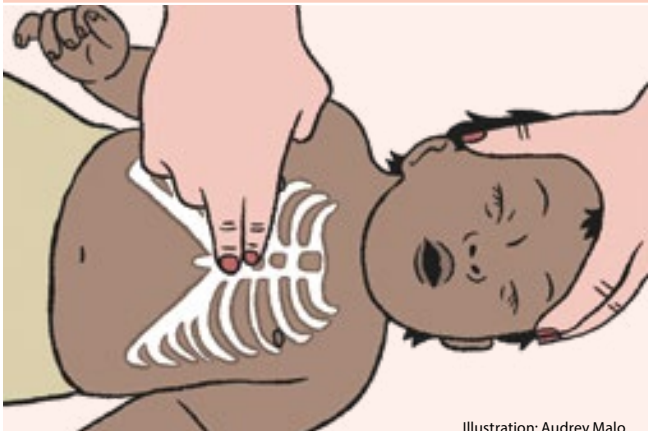
Illustration: Audrey Malo

Press down on the middle of the chest with 2 fingers, just below an imaginary line between the nipples.